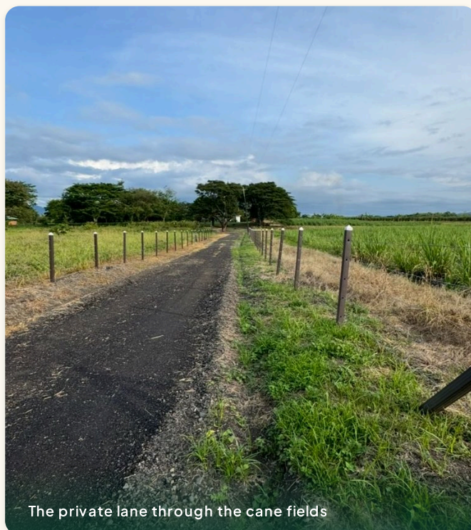
The private lane through the cane fields