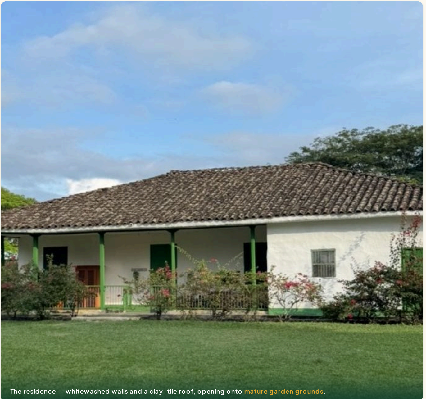
The residence — whitewashed walls and a clay-tile roof, opening onto mature garden grounds .