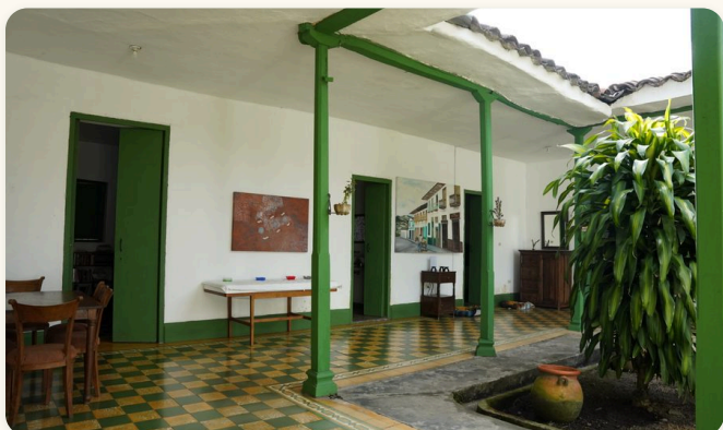
INNER COLONNADED COURTYARD