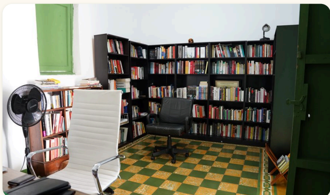
STUDY & HOME OFFICE