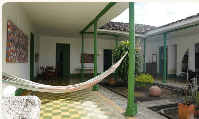
COURTYARD WITH HAMMOCK