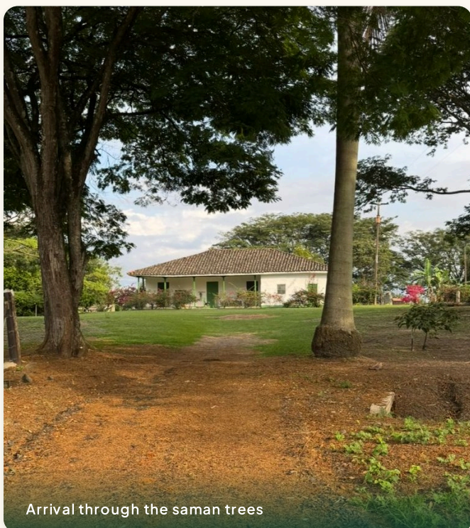
Arrival through the saman trees

ARCHITECTURE & CHARACTER Colonial-style architecture defines the estate: a clay-tile roof, whitewashed walls and a wraparound porch framed by green columns. Flowering gardens and two centennial saman trees — each more than a hundred years old — give the grounds their shade and their sense of permanence.