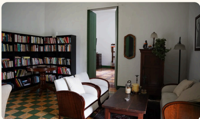
SITTING ROOM & LIBRARY

Beyond the porch, high-ceilinged rooms with original patterned-tile floors open onto a planted central courtyard — a home full of character and warmth, ready to be enjoyed.