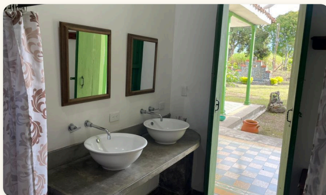
BATHROOM WITH TWIN BASINS