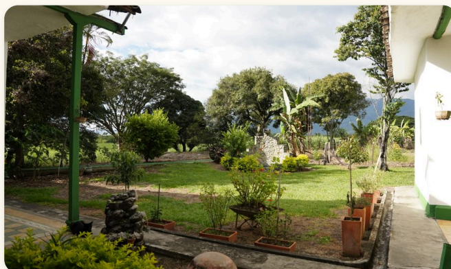
GARDEN & VALLEY VIEWS